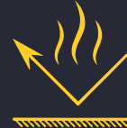
Fire-retardant dust cover