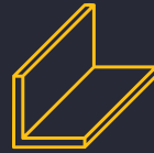
Aerospace-grade Aluminum (6061)